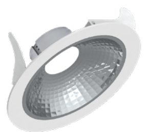
Luci Series Silver Shop 185