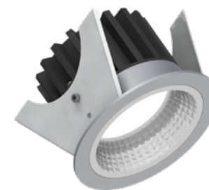
Luci Series Silver 75 fixed