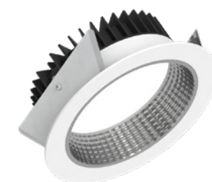
Luci Series Silver 185 fixed