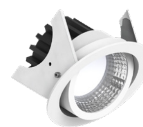
Luci Series Silver 90 directional